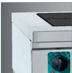
Side countertops easily removable to be used in a cooking line-up.