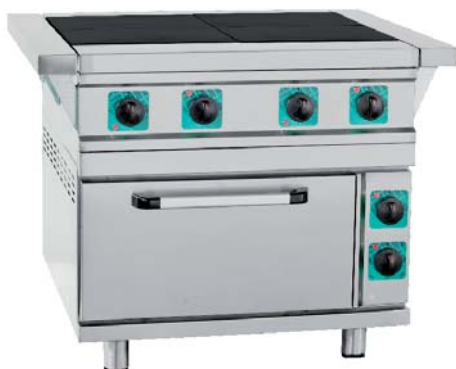
ASE-41 Cooker with oven.