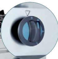
Heavy-duty reinforced control knobs on the front panel.