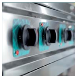
Big and robust control knobs on the front panel.