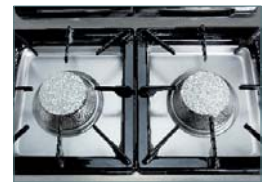
Smooth surface for easy cleaning. Grids made of enameled iron, heavy and stable for safe cooking.