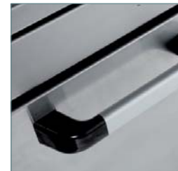
Heat resistant oven door handle.