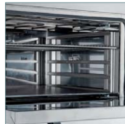
Gastronorm compatible 2/1 GN oven chamber with single drop-down door.