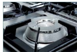
Open burners with 1-crown burner of 4.5 kW or 2-crown burners of 8 kW with possible combinations depending of number of burners of each model. Robust crowns with high-efficiency burners and provided with a flame safety device. Pilot ignition covered to avoid the breakage.

A complete range of products including 2, 4 and 6 burners with and without legs.