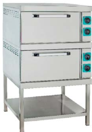
ASE-02 Electric ovens with shelf.