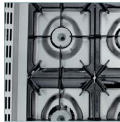
Heavy-duty grids made of enameled iron.