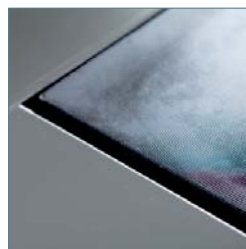
Hot plates flat surface enables cookware easy shifting and multiple cooking positions.