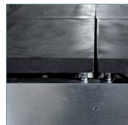
Heavy-duty cast-iron hot plates.