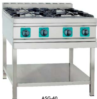
ASG-40 Gas range with shelf.