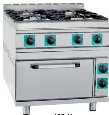
ASG-41 Gas range with oven.