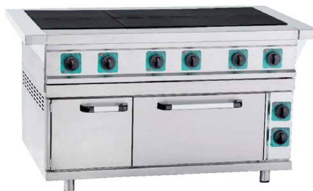
ASE-61 Cooker with oven and neutral cabinet.