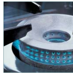
High-efficiency 2-crown burners.