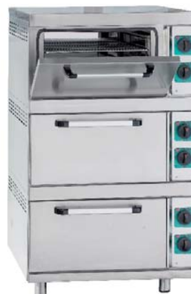
ASE-03 Electric ovens without shelf.