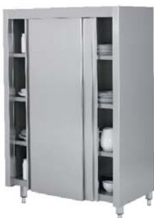
Standalone cabinets. Robust, large storage capacity.