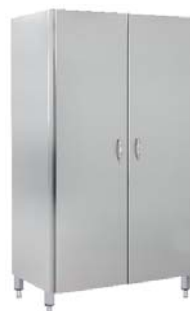
Cleaning storage cabinets. Better organization for cleaning products, improving sanitary standards.