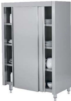
SC2-146/18 3S SD