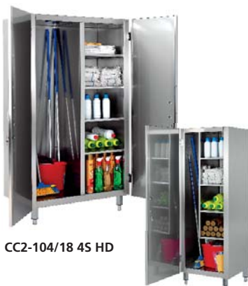
CC2-104/18 4S HD