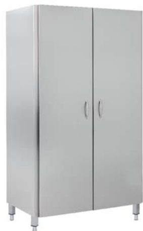
SC2-107/20 3S HD