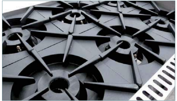
Heavy duty 12" x 12" cast iron top grates, easily removable.